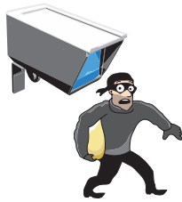
Camera in Action