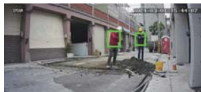
NO SAFETY VEST Video search 4 seconds

● Other features available upon request.